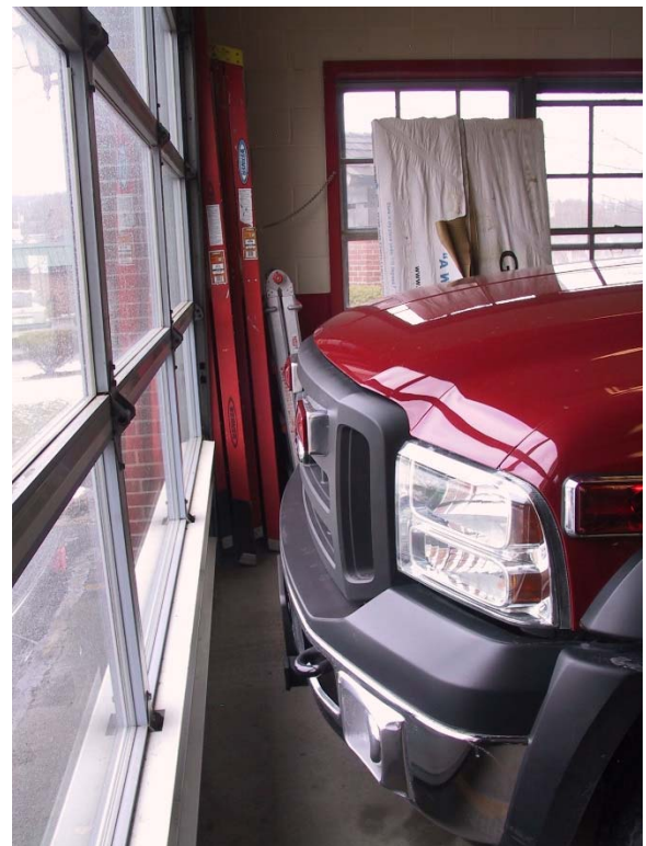
Current station is woefully short of adequate apparatus clearances as recommended by FEMA FA 168