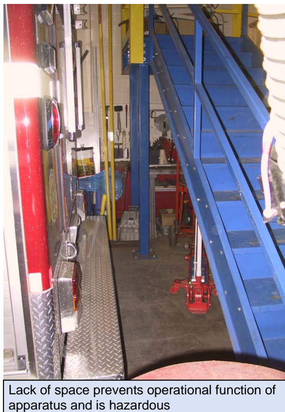
Lack of space prevents operational function of apparatus and is hazardous